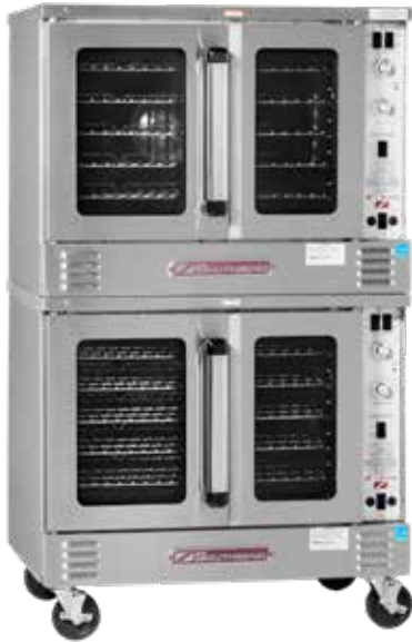
BGS/23SC shown with optional casters