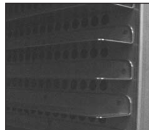
Optional fixed angle slides