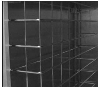
Standard fixed universal wire slides

PAN SLIDES... Universal wire slides at fixed spacing of 3". Assemblies removable. Hold 18"x26" sheet pans, 12"x20" steam table pans, 2/1 or 1/2 G/N pans. Adjustable universal stainless steel pan slides or fixed angle pan slides are optional.