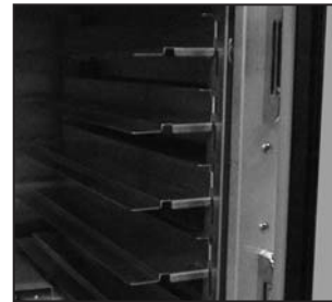
Optional stainless steel adjustable universal slides