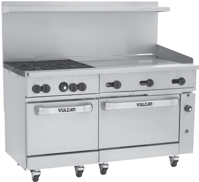
Model 60SS-4B36GN (shown with optional casters)