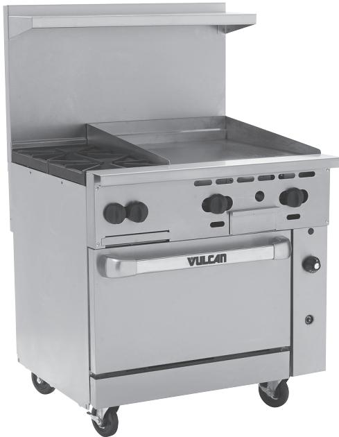
Model 36S-2B24GN (shown with optional casters)